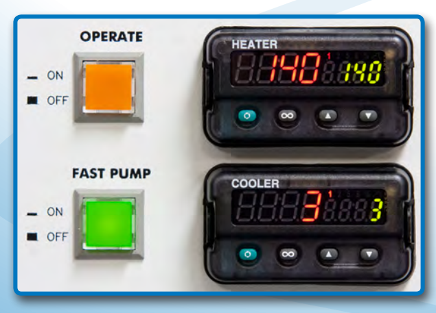
Operate Button and Temperature Controllers

The dedicated temperature controllers can be quickly reset for organic or aqueous applications.