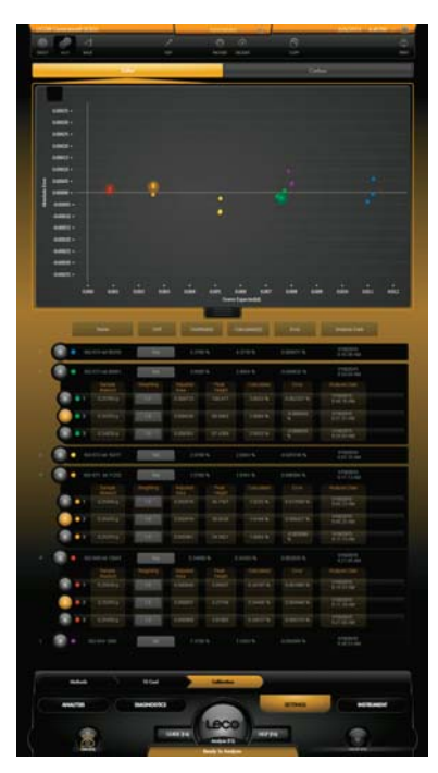
Settings ➤ Calibration