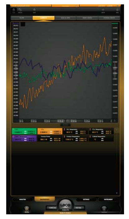
Diagnostics ▶ Ambients

Cornerstone also supports a multilingual interface, user permissions, extended data archiving and filtering, compatibility with various Laboratory Information Management Systems (LIMS), and flexible reporting capabilities.